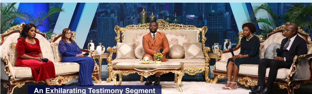
An Exhilarating Testimony Segment

Don’t miss the next edition of the Global Miracle Faith Seminar. It will be another grand opportunity to consolidate our victories from the just-concluded Live Healing Services. It promises to be a destiny-changing experience.